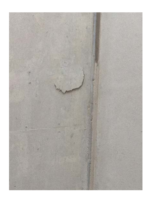
END OF ADDENDUM

5. Sheet A203: Add the following photo as Photo #4 along with the following Keynote #4 to this sheet. This area is on the northern end wall of lower deck and approximately 30' above the ground level. This wall is opposite of the northeast ramp. "Key Note #4 – Remove loose concrete and clean. Treat reinforcing steel with rust inhibitor, apply bonding agent and apply new concrete repair mortar SIKA Top 123 Plus and Armatec A110. Finish tomatch adjacent surface upon completion of repair."